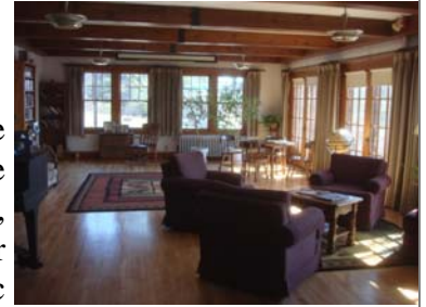
Above: Main Lodge living room is both comfortable and functional.

As I write this we are starting a complete remodel of 204's bath, installing new low water usage toilets in 204, 5c and 5d and replacing the very worn out vanity in 5d. We plan on painting all lodge rooms/baths this winter season and will hopefully complete remodeling of 2 other lodge bathrooms—212 and 202. This old Lodge is getting newer all the time!