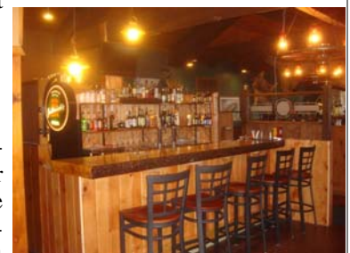
The bar area of the new pub featuring Guinness on tap! There is also table seating in the pub that has added 35 seats to our overall capacity.