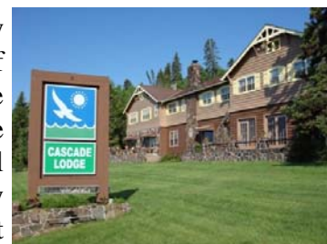
Cascade Lodge Cascade Restaurant

pub open and I am happy to report that nearly all of our guests LOVED the change! We enjoyed live music on Fri-Sat nights all winter long and Saturday nights all summer. Not only did our beverage sales rise significantly, our entire restaurant business was up substantially from previous seasons. Overall, we are feeling very thankful to all of our repeat and new guests this year and we sincerely appreciate your business.