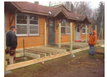
Below: Deck being built