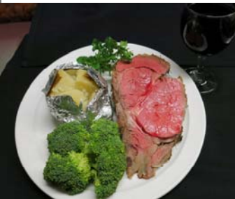
Delicious, hand-cut prime rib every Saturday evening!!

We've had an exiting year at the Restaurant! We have 3 new chefs, all of whom bring valuable experience with them! We'll be reviewing our menu and hope to add some delicious new entrees and appetizers! We served Bangors & Mash for our