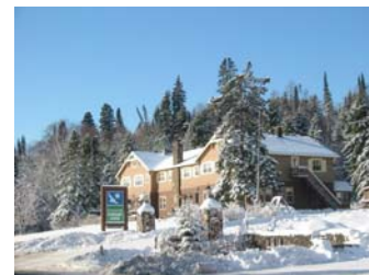
Cascade Lodge Cascade Restaurant

and stay packages! After all of these fantastic winter experiences enjoy a daily happy hour from 3-6pm in our Northwoods Irish themed pub featuring 1/2 price appetizers and dollar off drinks daily! Enjoy are new high speed fiber based broadband internet available in the lodge, restaurant and most cabins (hopefully all by winter!), and catch your favorite TV show on our new Dish network system with 100's of channels at your fingertips.