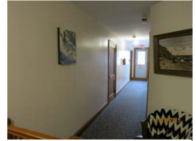
Above: New Carpet, artwork and look in Main lodge+office

service may use their phone here at Cascade Lodge—of course, any phone can text on our wifi. We installed new carpeting and artwork in our main lodge hallways as well as our main office area. During work week Cabin 8 got a new deck/roof and we stained Cabins 2 and 3 as well as installing new decking on Cabin 3. Finally, we improved our outdoor social areas—whew!