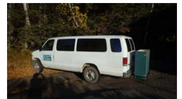
Below: Our "new" 14 passenger van for shuttling guests.