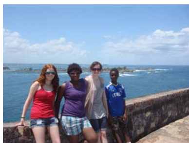
Us-at a fort in Old San Juan in Puerto Rico.

Don't go to the rainforest without a raincoat like we did!