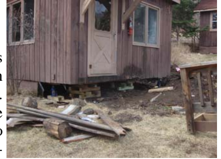
Cabin #9's old wooden foundation failed during the winter. We had to replace it this spring or we faced losing the cabin!

DVD players as they have proven to be unreliable. At present, we are working hard to put a new foundation under cabin #9. It failed this winter and when we opened it up to see what was going on we found that it was barely supported on old cedar beams placed directly in the ground! We are replacing the entire foundation with concrete blocks and solid footings. We hope to have it open by Memorial Day Weekend.