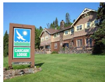
Cascade Lodge Cascade Restaurant

page 2 for more details. As we prepare for the upcoming season—our 7th summer here—we want to thank each and every one of you for the pleasure of serving you and your family. It has been a blessing to all of us to get to know many of you and to see that you appreciate and enjoy both the resort, the efforts we have put into it and the magnificent North Shore area. Blessings to all!