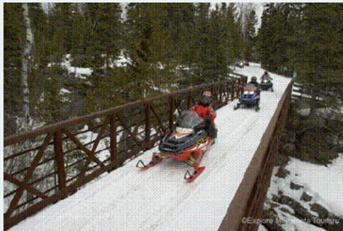
Lots of fun Snowmobile Trails right from your door!