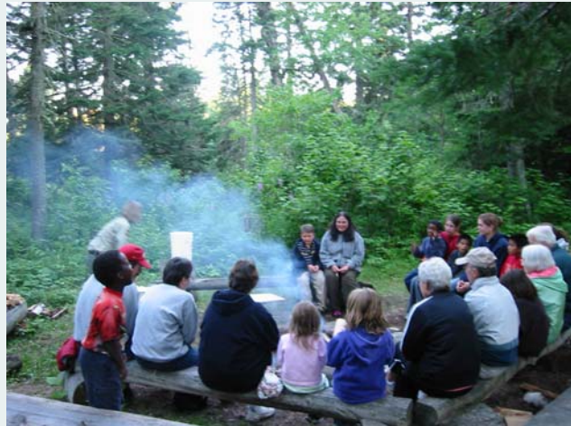
Summer Activities Program Presentation