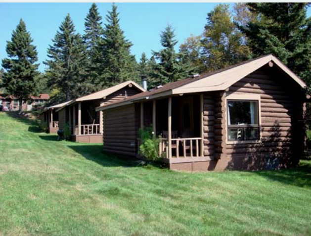
Log Cabins 1, 2, 3