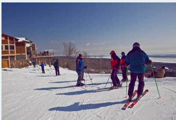
Upper Midwest's Premier Alpine Skiing at Lutsen Mountains

Whichever season whets your appetite Cascade Lodge is here to fill that need. Let the North Shore renew your spirit, help you see things more clearly and then return you home refreshed. Give us a call and let us show you Cascade Country .