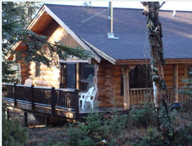
Luxury Log Cabin 12