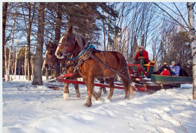
Horse Drawn Sleigh Rides