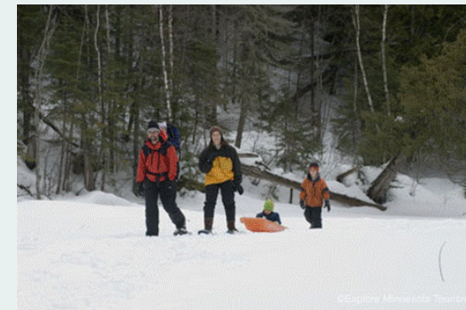
Snowshoe Trails for the whole Family!