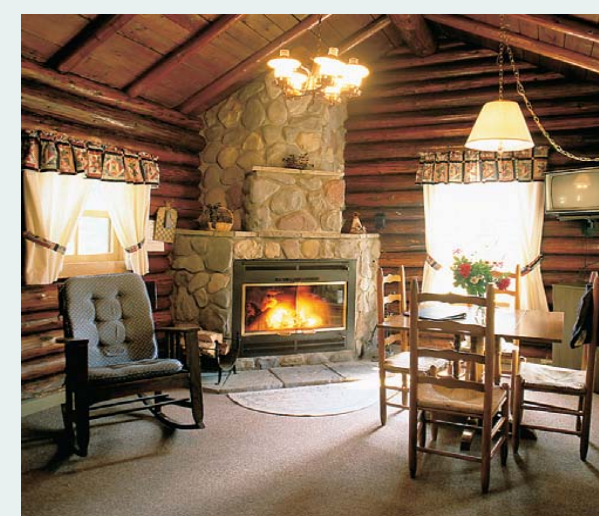
Log Cabin 2

The Main Lodge has a cozy stone fireplace and two large living rooms overlooking the lake. The lodge also serves as a focal point for the grounds and provides comfortable accommodations. An assortment of beautiful log cabins and frame cabins, some with fireplaces, whirlpools, kitchenettes and decks, offer a variety of conveniences to meet every taste. The Caribou Hideaway House is a secluded vacation home that can provide accommodations for groups large and small.