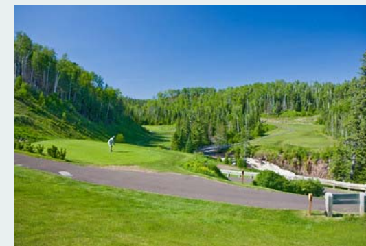
Nearby 27 Hole Superior National Golf Course